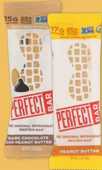
Perfect Bar Protein Bar selected varieties