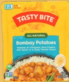
Amy's Burrito selected varieties