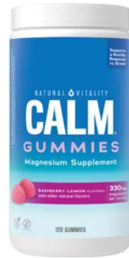
Natural Vitality Calm Gummies selected varieties