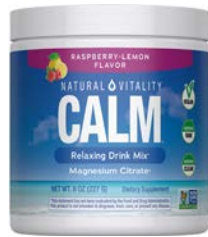
Natural Vitality Natural Calm selected varieties

Natural Vitality magnesium supplements have been a health ally since 1982. With a passion for natural health, we've been designing supplements that support natural vitality for over 40 years.