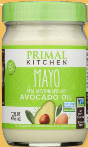
Primal Kitchen Mayo with Avocado Oil selected varieties