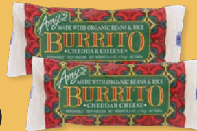
Pacific Foods Organic Soup selected varieties