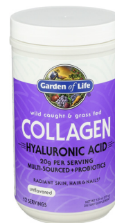
Garden of Life Collagen with Hyaluronic Acid