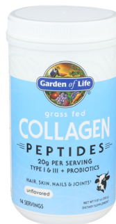
Garden of Life Grass Fed Collagen Peptides

Looking to up your protein intake? How about support for hair, skin, nails, and joints? Garden of Life offers just what you're looking for with clean, nutritious, and delicious protein and collagen choices tailored to your needs.