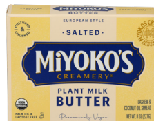
Miyoko's Organic Cultured Vegan Butter

Built on the foundation of craft and compassion, Miyoko's Creamery is the natural, compassionate evolution of dairy—using time-honored techniques and the finest ingredients to make our award-winning, phenomenally vegan, plant-milk butter and cheese.