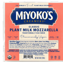
Miyoko's Organic Vegan Mozzarella