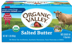
Organic Valley Organic Butter