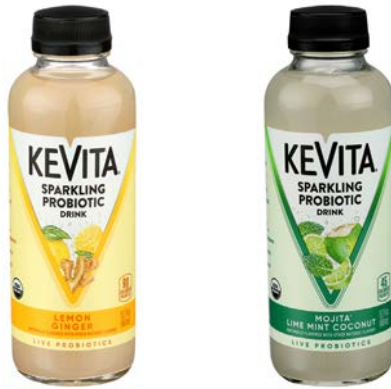
KeVita Organic Sparkling Probiotic Drink (selected varieties)

Your GUT HEALTH is our priority! Proudly producing organic probiotic Kombuchas and dairy-free Kefir drinks since 2009. With new Lemonades and innovative Herbal Spritzers, Sparkling Refreshers and Kombuchas, KeVita offers a delicious option for everyone's tastebuds and lifestyles.