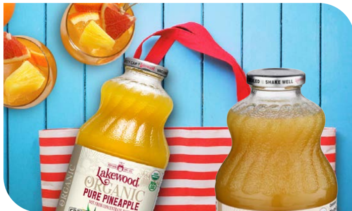
Lakewood Organic Pure Pineapple Juice