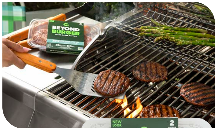
Beyond Meat Beyond Burger